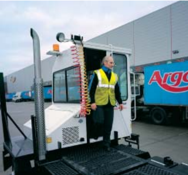
The tall cab with the sliding rear door and the flat rear deck are designed for operator safety and comfort.