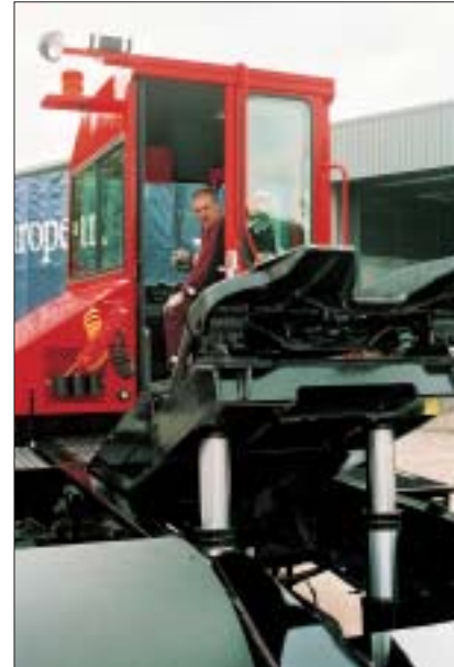
A boxed fifth wheel boom assembly and a unique ball-joint lift cylinder system boost tractor efficiency.