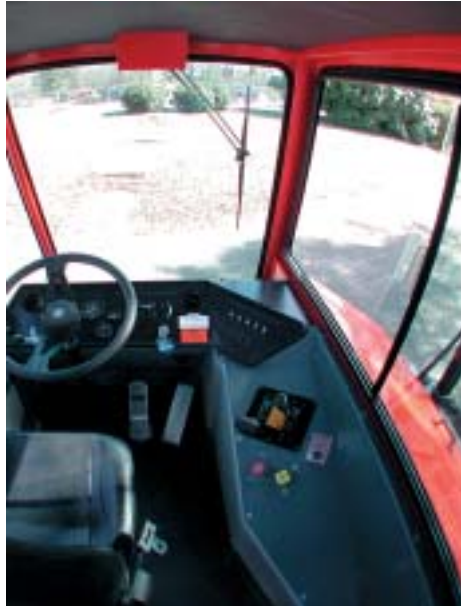
Large windows and angled corners provide excellent all-around visibility. All switches and instruments are within easy reach.